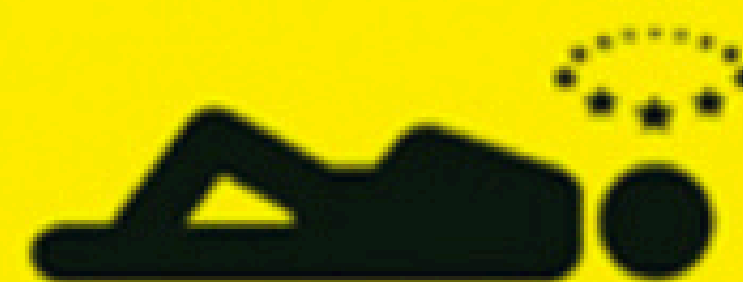
LOSS OF CONSCIOUSNESS